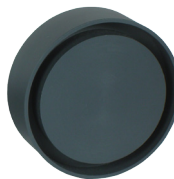
LOOSE CAP (L)

Cap is loose and easily removed for cleaning and manual filling. Used in applications where the cylinder must be filled from the top with no positive suction head.