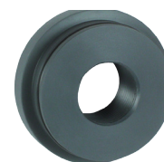
QUICK OFF CAP (Q)

Cap is sealed with an O-ring and includes an NPT vent connection. Used in applications where frequent cleaning is required, such as polymer, alum, ferric chloride or chlorine.