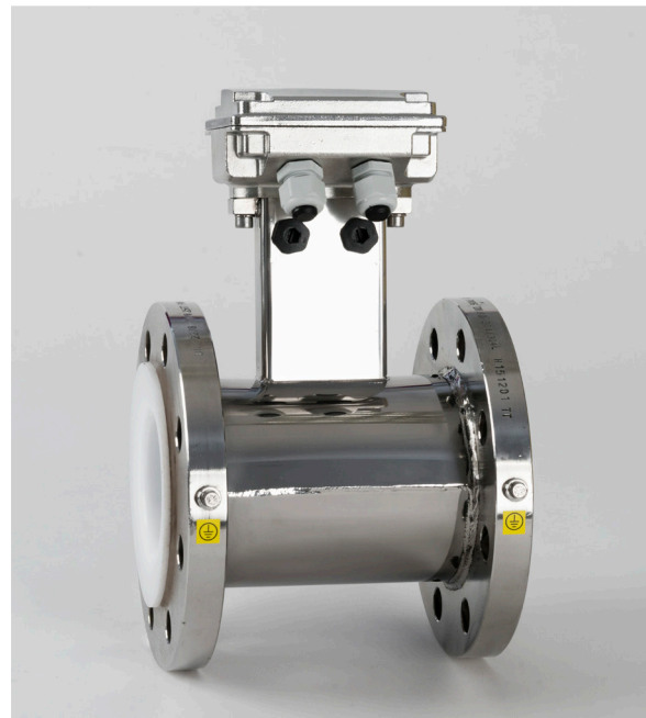
The MS2500 shown with stainless steel body, PTFE liner and junction box for remote mounted converter.