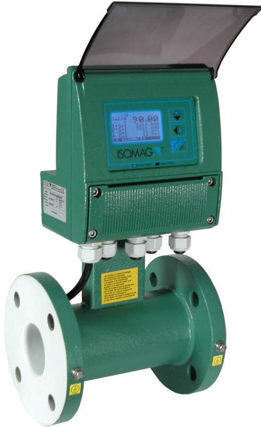
The MS2500 is available with Rilsan, Polypropylene, Ebonite, PTFE or PFA liner with compact or remote mounted converter. Shown here with Rilsan liner and MV210 Converter.

The MS2500 is certified to NSF/ANSI Standard 61 for 1" to 80" sensors.