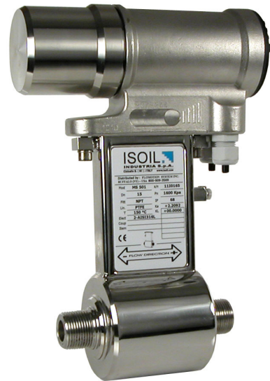
The MS501 shown with the ML4F1 High Speed Batching Converter.