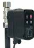
AutoPurge with motorized ball valve