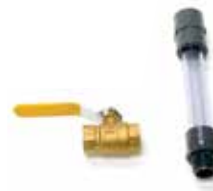
Manual & Visual Purge Options