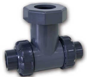
ST-001 Inline Tee for CPVC Installations