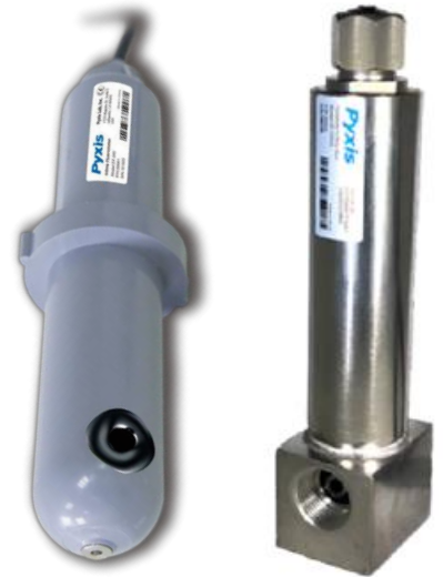
HM-500 & HM-500SS Series Oil In Water Sensors

The Pyxis HM-500 series inline fluorometer sensors measure the concentration of oil in water read as ppm Marine Crude-Offshore Oil. The sensors utilize an LED sourced UV-fluorescence methodology at 365nm wavelength and 410/470nm excitation. Pyxis HM-500 series sensors are uniquely designed with extra photo-electric components that also monitor the color and turbidity of the sample water. This proprietary feature enables the HM-500 series to automatically compensate for color and turbidity in the water sample eliminating interferences commonly associated with real-world waters, up to 150NTU. The Pyxis HM-500 series inline sensors have a short fluidic channel and can be easily cleaned. The fluidic and optical arrangement of the HM-500 series are designed to overcome shortcomings associated with other fluorometers that have a distal sensor surface or a long, narrow fluidic cell. Traditional inline fluorometers are susceptible to color/turbidity interference and fouling and can also be very difficult to clean. These unique features provide HM-500 series with a level of accuracy far greater than conventional inline oil in water sensors and enable users to conduct wireless inline sensor cleanliness diagnostics as a predictive measure via the uPyxis APP for mobile and desktop devices.